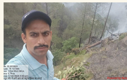
On duty, controlling a forest fire just before the accident

At its seventh meeting, the GB approved financial assistance of ₹2.00 lakh to the mother of the deceased, the recorded beneficiary in the Government's records. The amount was credited to her account without delay. The assistance is a token of the fraternity's solidarity, over and above any entitlement due from the State.