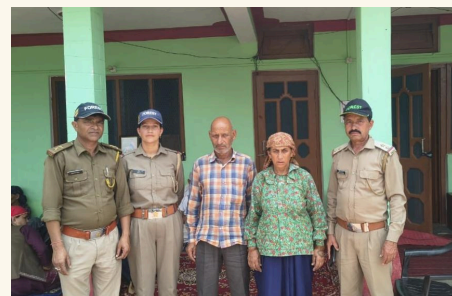
Trust officials with the parents of the late FG